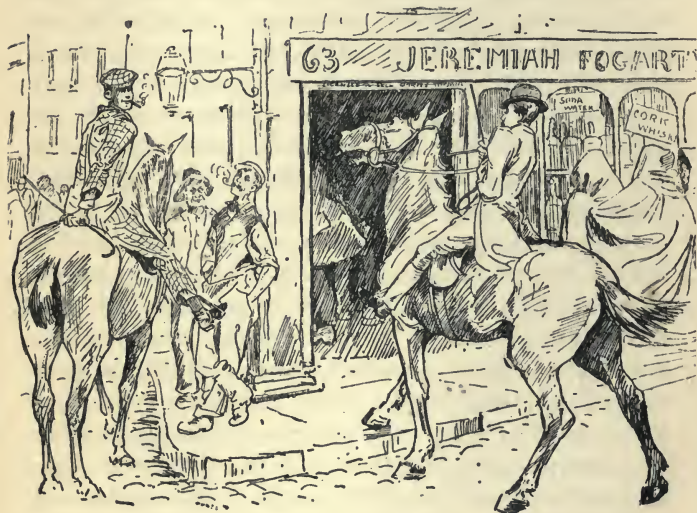
SHE MOUNTED THE PAVEMENT IN FRONT OF A VERY DISREPUTABLE PUBLIC-HOUSE

"I say! This is something like going!" said